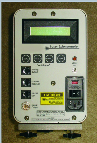
Model LE-05 laser extensometer control panel

These extensometers are high precision non-contacting units for strain measurement in materials testing. They use a high speed laser scanner to measure the spacing between reflective tape strips on the sample. The measurement range is from 8 to 127 mm (0.3 to 5 inches). The gauge length is determined by the user. This allows high elongation measurements when shorter gauge lengths are used.